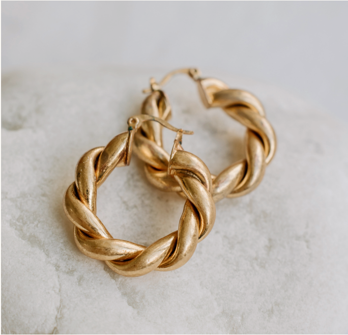
YELLOW GOLD HOOP EARRINGS