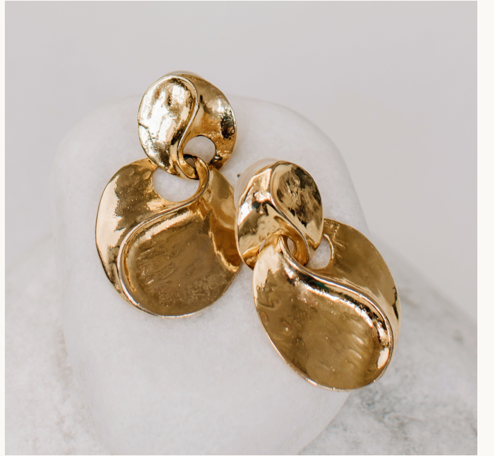
GOLD DROP EARRINGS