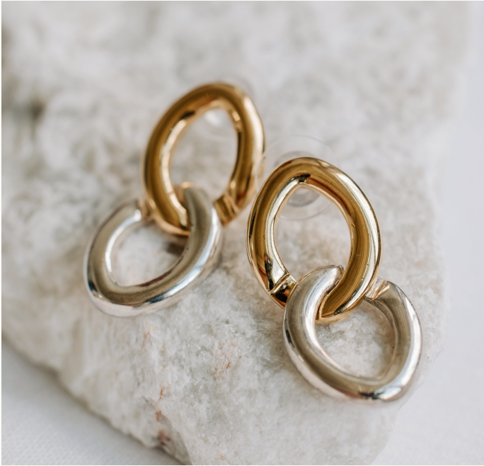
TWO-TONE GOLD LOOP EARRINGS